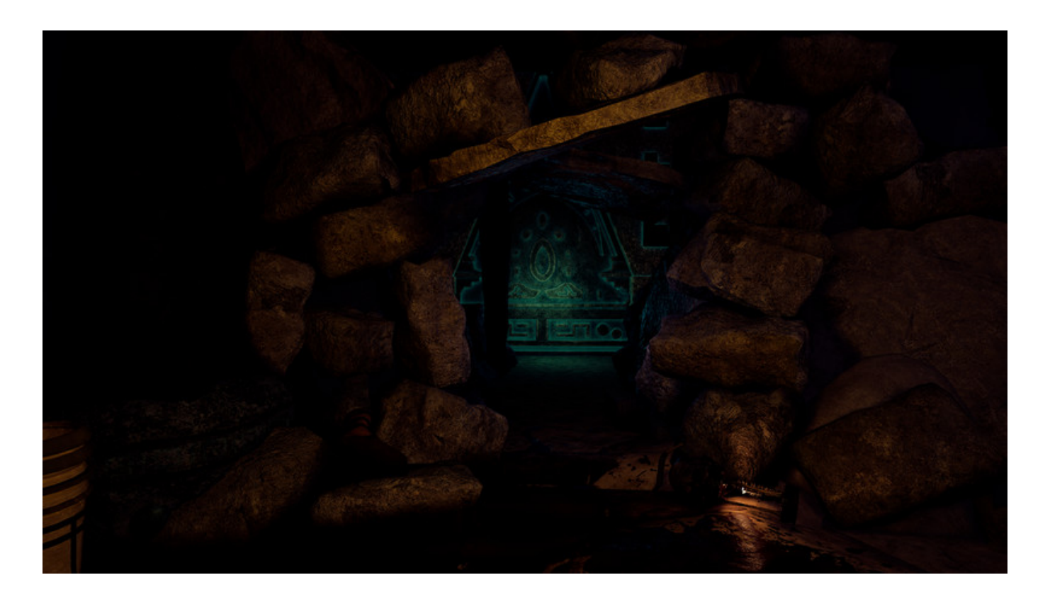
Download ->>->> <a href="http://bit.lv/2NEgPT7">http://bit.lv/2NEgPT7</a>

Draft Day Sports: Pro Football 2019 Verification Download